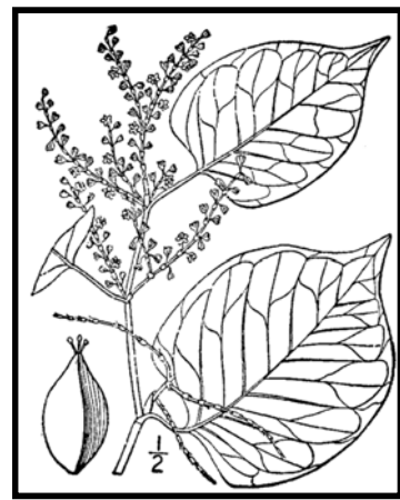
Japanese knotweed Polygonum cuspidatum USDA-NRCS PLANTS Database / Britton, N.L., and A. Brown. 1913. An illustrated flora of the northern United States, Canada and the British Passessions, Vol. 1: 676

Bagging (solarization): Use this technique with softertissue plants. Use heavy black or clear plastic bags (contractor grade), making sure that no parts of the plants poke through. Allow the bags to sit in the sun for several weeks and on dark pavement for the best effect.